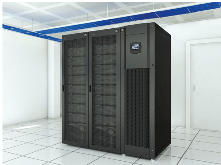
Liebert® CRV in small room application