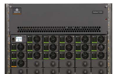
NetSure™ 5100 System, External Distribution 19.2 kW, 23" Rack (582137100)