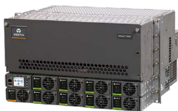
NetSure™ 5100 System, External Distribution 18 kW, 19" Rack (582137100)