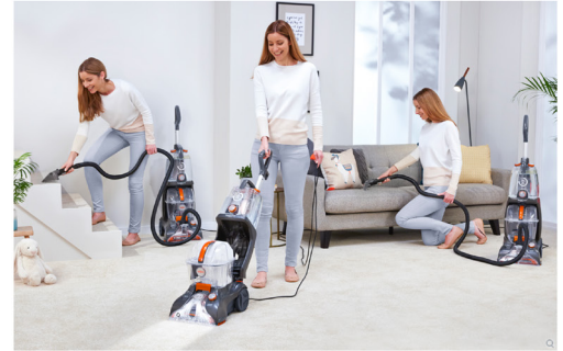
Extra Large Tank for a Longer Clean

Not only powerful, the Rapid Power Refresh has an extra large tank capacity so you can clean for longer.