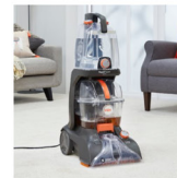
Twin tanks The Twin Tanks ensure clean and dirty water is kept separate, meaning you'll only ever put clean water and solution into your carpets.