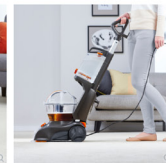
The More Hygienic Way To Wash Your Carpets* Embedded with antimicrobial treatment which prevents the growth of odour causing bacteria, mould and mildew.