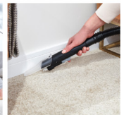
Crevice Device Ideal for cleaning tight narrow spaces for a thorough home clean.