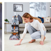
Quick Dry Carpets are dry in less than 1 hour when using in quick clean mode*. Leaving your carpets dry and smelling fresh.