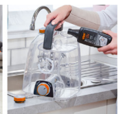
Automix Technology Our automatic cleaning system takes the hassle out of measuring solution and provides the correct mix of solution and water for the best cleaning results.